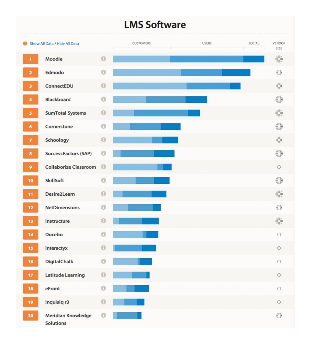
Figure 2 Global LMS Software usage ranking [2]

(The picture shows the worldwide LMS software rankings, which reflect the standards of the global learning system. Which if you want to solve problems and develop standards of the learning system to have a standard You may want to consider the most popular LMS software. With details in the topic "Discussion of the result")